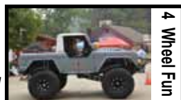
4 Wheel Fun

HOT WHEELS GRAVITY DRAGS $300 in cash prizes!