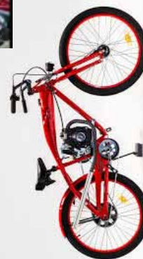
CLASSIC 2 WHEELERS

Ways to be a part of Northern California's Best Car Show!